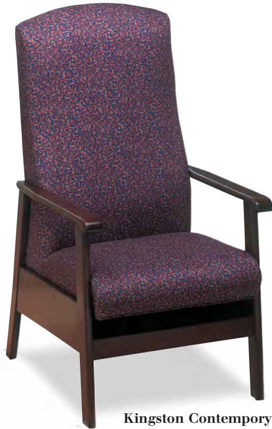
Kingston Contemporary Model 1385