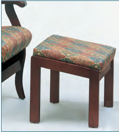
Ottoman • Model 1351