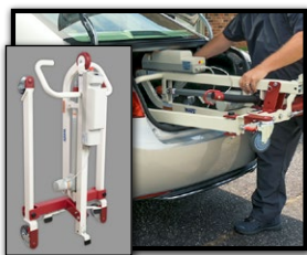
Folds flat for easy transport and storage.