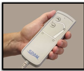
2-button pendant with LED indicator.