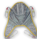
Re-usable and disposable specialty slings