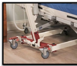
Underbed clearance allows use with most low beds.