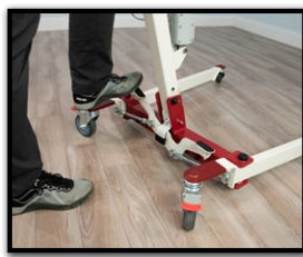
Foot pedal base width adjustment.