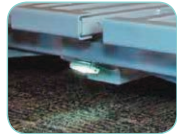
Underbed lights illuminate below Smart Stop level.