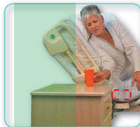
Ordinary fixed deck bed: the seat deck does not move during HOB elevation, forcing user out of vertical alignment.