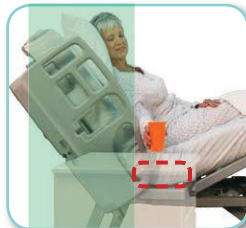
Encore: seat deck retracts during HOB elevation maintaining the user in a safer comfortable zone of vertical alignment (shaded green).

Why vertical alignment is vital in long-term care: