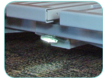
Underbed lights illuminate below Smart Stop level.