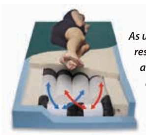
As user shifts position, reservoirs absorb displaced air to accommodate load and re-equalize pressures.

Use it in-facility to slash rental costs, increase user satisfaction, and improve regulatory compliance on issues from skin care to bed safety. Or, select it as a trouble-free but supremely effective option for at-home users.