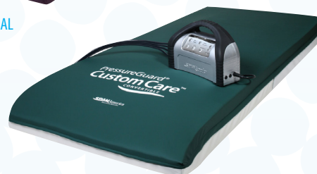
Custom Care® Convertible