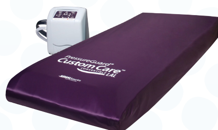
Custom Care® Convertible LAL