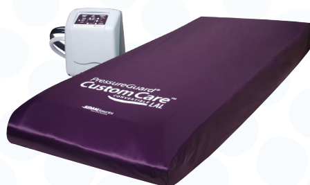
Custom Care® Convertible LAL