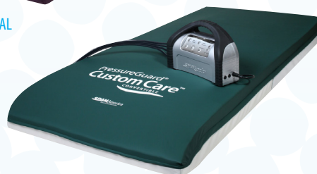
Custom Care® Convertible